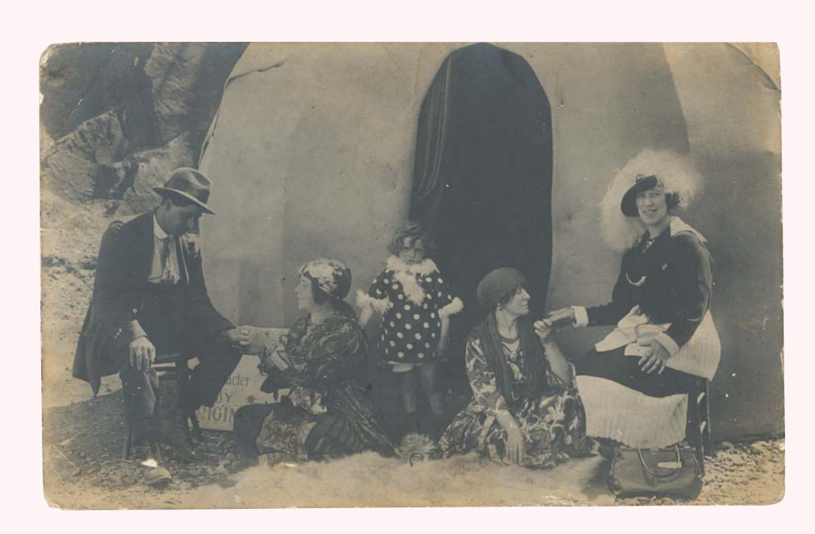
Boswells, Isle of Man showing an early rod tent.

But we hope it inspires you to explore your own family history.