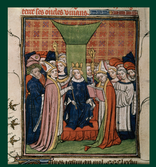
Coronation of Richard III.