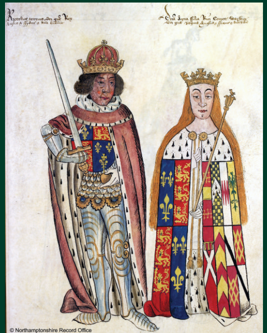
Richard and his wife Ann Neville.

Edward rewarded those who had been loyal to him with lands and titles. During the 1470s Richard acquired great estates in Yorkshire, Cumbria and Northumberland. His marriage to Anne Neville, Warwick's daughter also brought him great wealth and power in the North. The pinnacle of his power and influence came in 1474, when he was declared the Lord of the North in a treaty with the Earl of Northumberland. Richard's loyalty to Edward is surely one of the reasons he was appointed Lord Protector to his son.