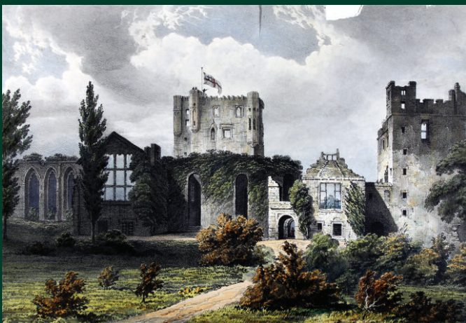
Ashby-de-la-Zouch Castle, mid-19th century. Edward IV granted the castle to William Hastings, who undertook major building works to extend and improve it.