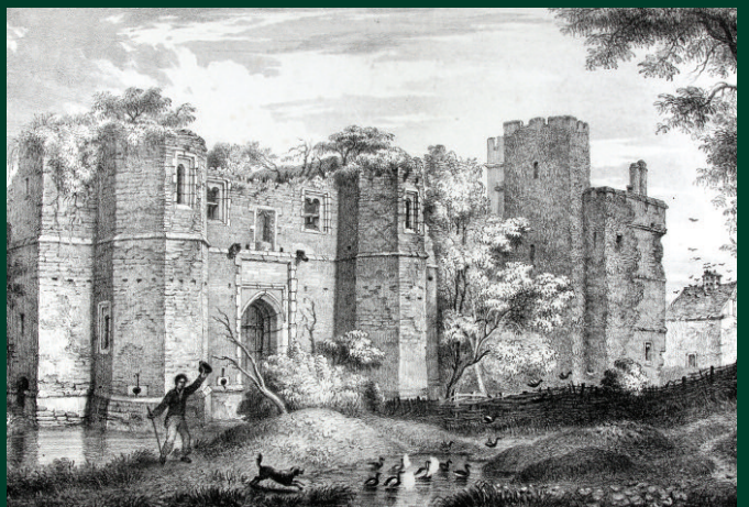
Kirby Muxloe Castle by John Flower, 1826. The building was begun by William Hastings in 1480, but it was never completed following his execution in 1483.

Hastings was with Edward and Richard in exile and fought in the battles which restored the King. Like Richard, he was connected to the Neville family when he married Warwick's sister Katherine in 1462.