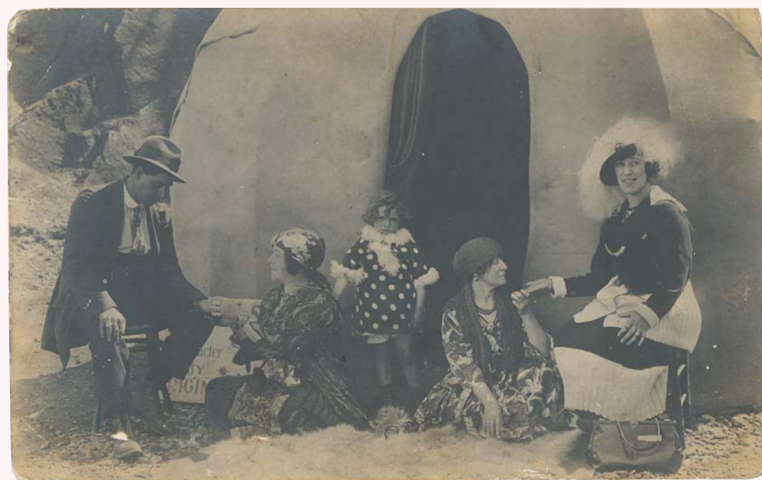
Boswells, Isle of Man showing an early rod tent.