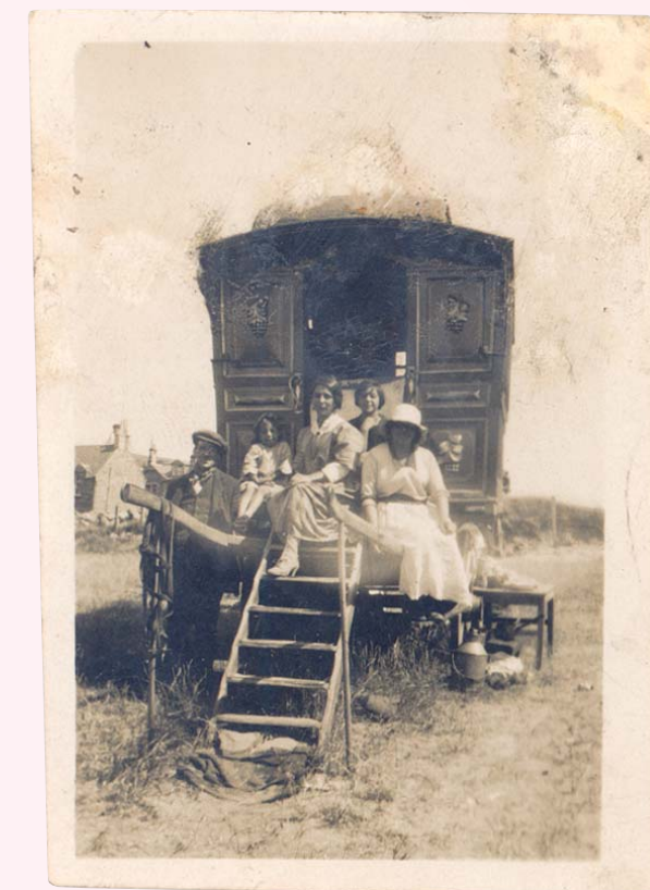
Gray family with trailer, Ireland.